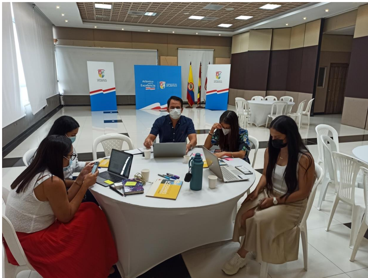
Figure 2. Socialization of the Catalogue of Decarbonization Actions in Energy and Transport with Atlántico's Secretariats

In addition, an external consultant, led a quality assurance process of the catalogue, and delivered a prioritization tool to identify the most relevant mitigation measures for each department. The tool uses two criteria, the level of readiness that determines the level of knowledge, tools, experience, and capacity that the department has to implement an action. To determine the level of readiness the tool uses the following indicators: 1) Availability of a policy and/or regulatory framework to support the measure both at national and at the subnational level, 2) Availability of funding sources or incentives to promote the measure and 3) Return of the investment which responds to the profitability of the projects associated with the measure. The second criteria determine the capacity to promote a sustainable low-carbon economy . To determine the