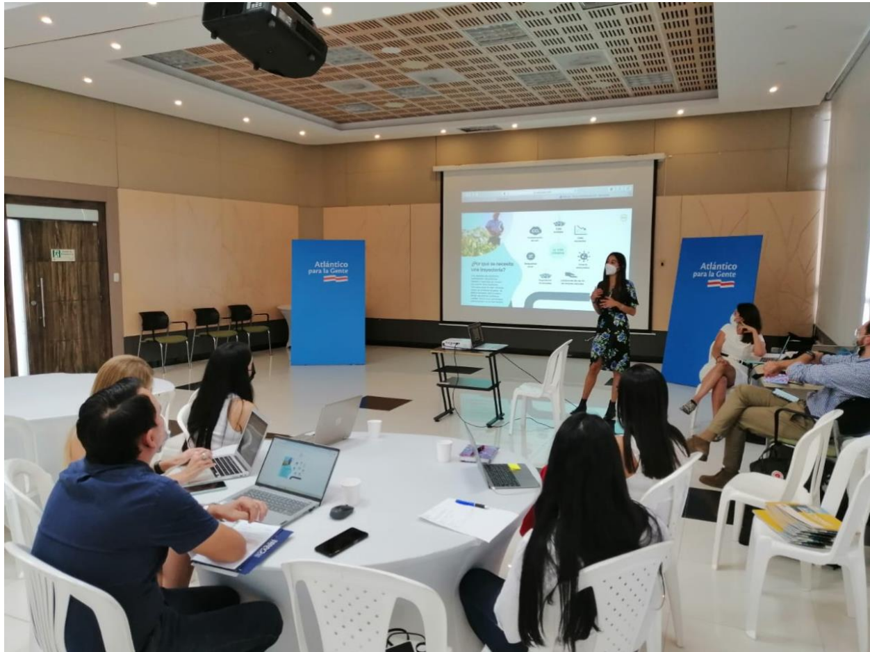
Figure 1. Pathways and Decarbonization Vision Creation with Atlántico's Secretariats