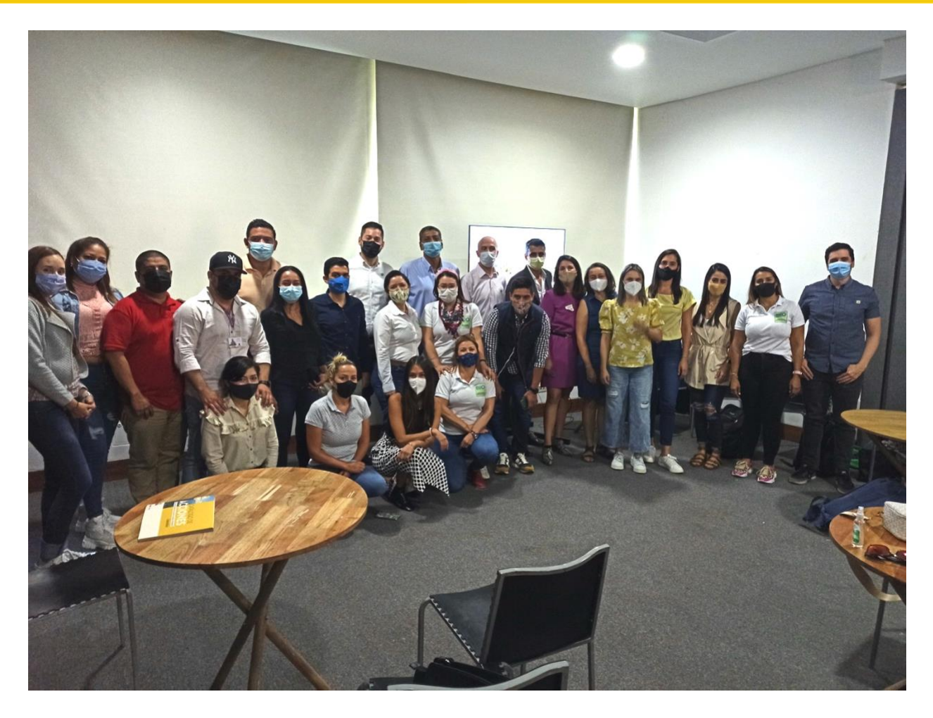
Figure 2. Socialization of the Catalogue of Decarbonization Actions in Energy and Transport with Antioquia's Secretariats

In addition, an external consultant, led a quality assurance process of the catalogue, and delivered a prioritization tool to identify the most relevant mitigation measures for each department. The tool uses two criteria, the level of readiness that determines the level of knowledge, tools, experience, and capacity that the department has to implement an action. To determine the level of readiness the tool uses the following indicators: 1) Availability of a policy and/or regulatory framework to support the measure both at national and at the subnational level, 2) Availability of funding sources or incentives to promote the measure and 3) Return of the investment which responds to the profitability of the projects associated with the measure. The second criteria