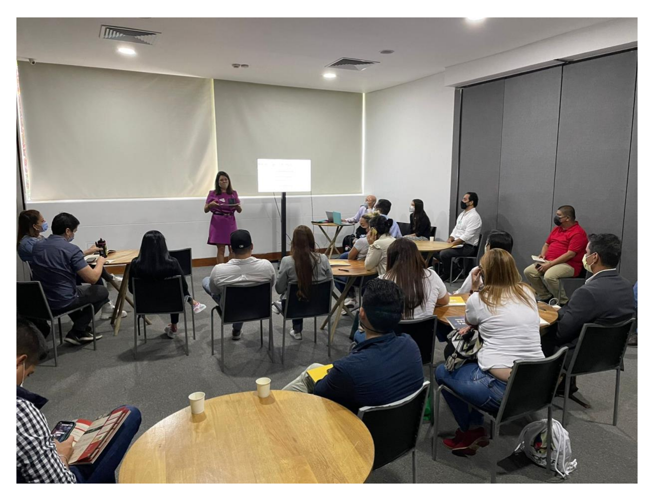
Figure 1. Pathways and Decarbonization Vision creation with Antioquia's Secretariats